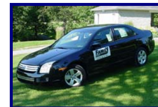
Participants will vie for a chance to win a car on hole #13!

Please provide the names of the individuals who will be representing your company by playing in the tournament.